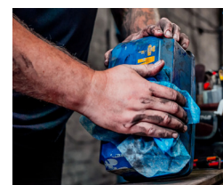
Cleans grime from tools