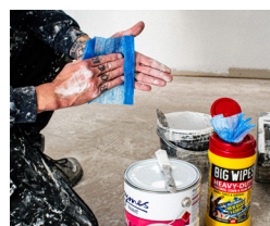
Cleans paint from hands