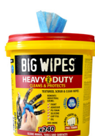
Heavy-Duty PRO+ Industrial Wipes Bucket 240's