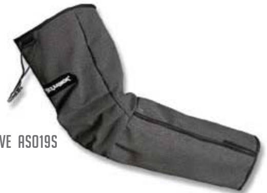
ARM SLEEVE AS019S