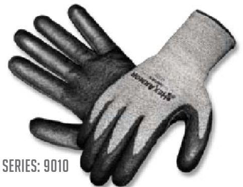
LEVEL SIX SERIES: 9010