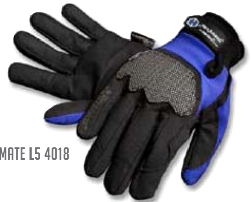
ULTIMATE L5 4018