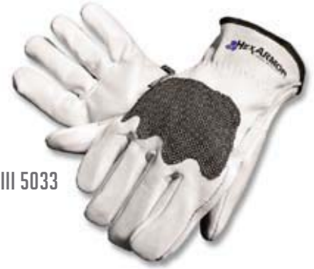
STEELLEATHER™ III 5033