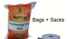
Bags + Sacks